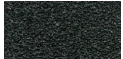
NS4500 Series Slip Resistant Resilient Safety Tape

Testing Method: ASTM D1894-95 Kinetic Coefficient of Friction Testing 7/97