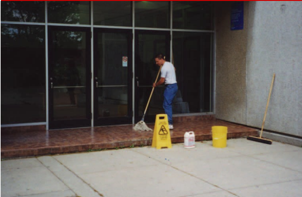
Entrance to Commercial Complex